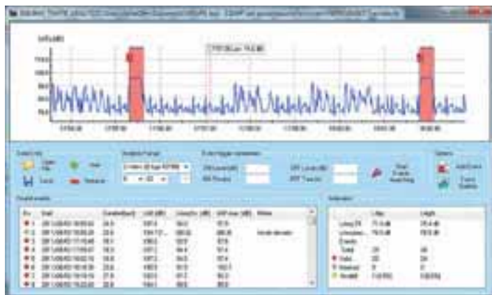
Noise Studio: NS2A “Acoustic Pollution” module; railway traffic noise, 24h analysis with automatic identification of train transits.

Noise profiles detected outdoor, are analyzed in order to search for annoying sources characterized by a sequence of events such as railways and airports. The analysis is performed on a daily basis with a resolution equal to 1/8 of a second and with automated detection and analysis of sound events. This module works on time histories acquired with option “Advanced Data Logger” installed on the sound level meter.