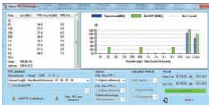
Noise Studio: NS1 “Workers Protection” module; PPE effectiveness analysis.

This application module analyses noise and vibrations in the workplace according to the European directives 2003/10/EC, 2002/44/EC, UNI 9432/2011 and ISO 9612/2011. Sound level measurements and vibration measurements in workplaces are organized in a project where they can be handled and analysed according to standards requirements. The company information, the list of workers and the noise or vibration sources are organized in a database. In addition to calculating the noise exposure of workers the program allows to evaluate the effectiveness of personal protective equipment (PPE) using the SNR, HML and OBM methods (the method applied depends on the presence or not of octave band spectrum on the sound level meter performances). According to UNI 9432/2011, the program also calculates the impulsiveness index of a noise source. The software creates complete reports both for individual worker and synthetic including the company exposition summary. Reports can be exported or printed directly.